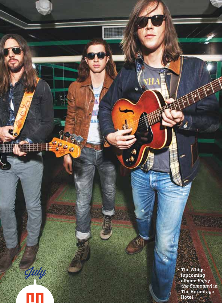
► The Whigs (upcoming album: Enjoy the Company ) in The Hermitage Hotel