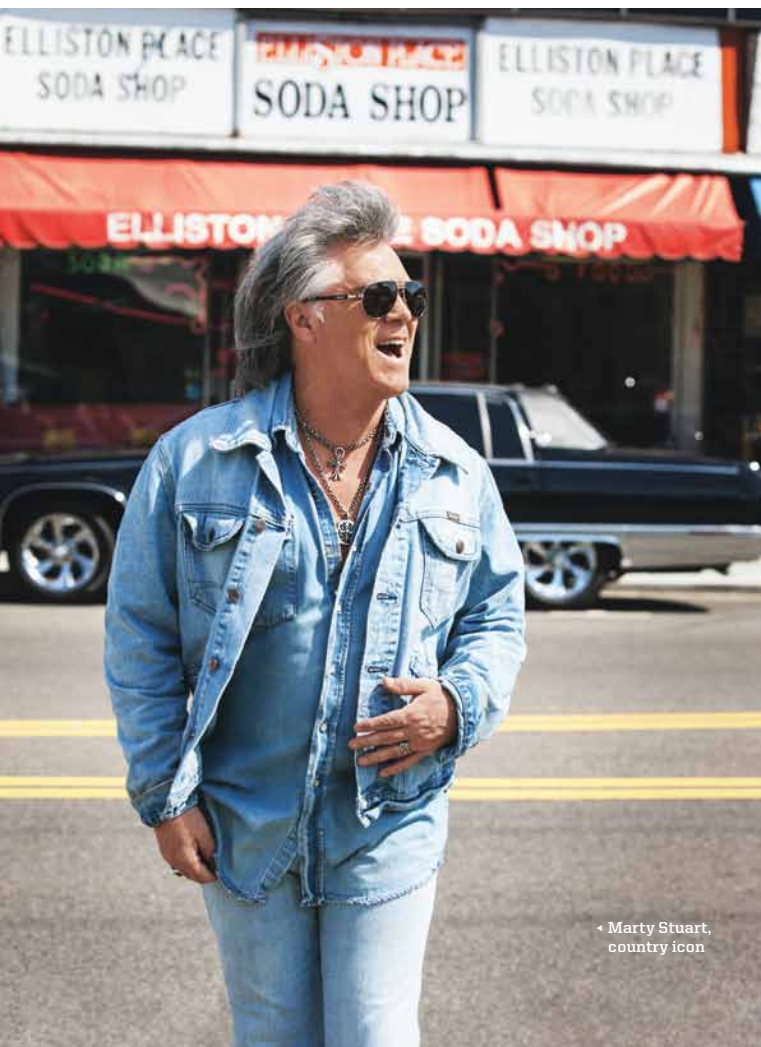
◀ Marty Stuart, country icon