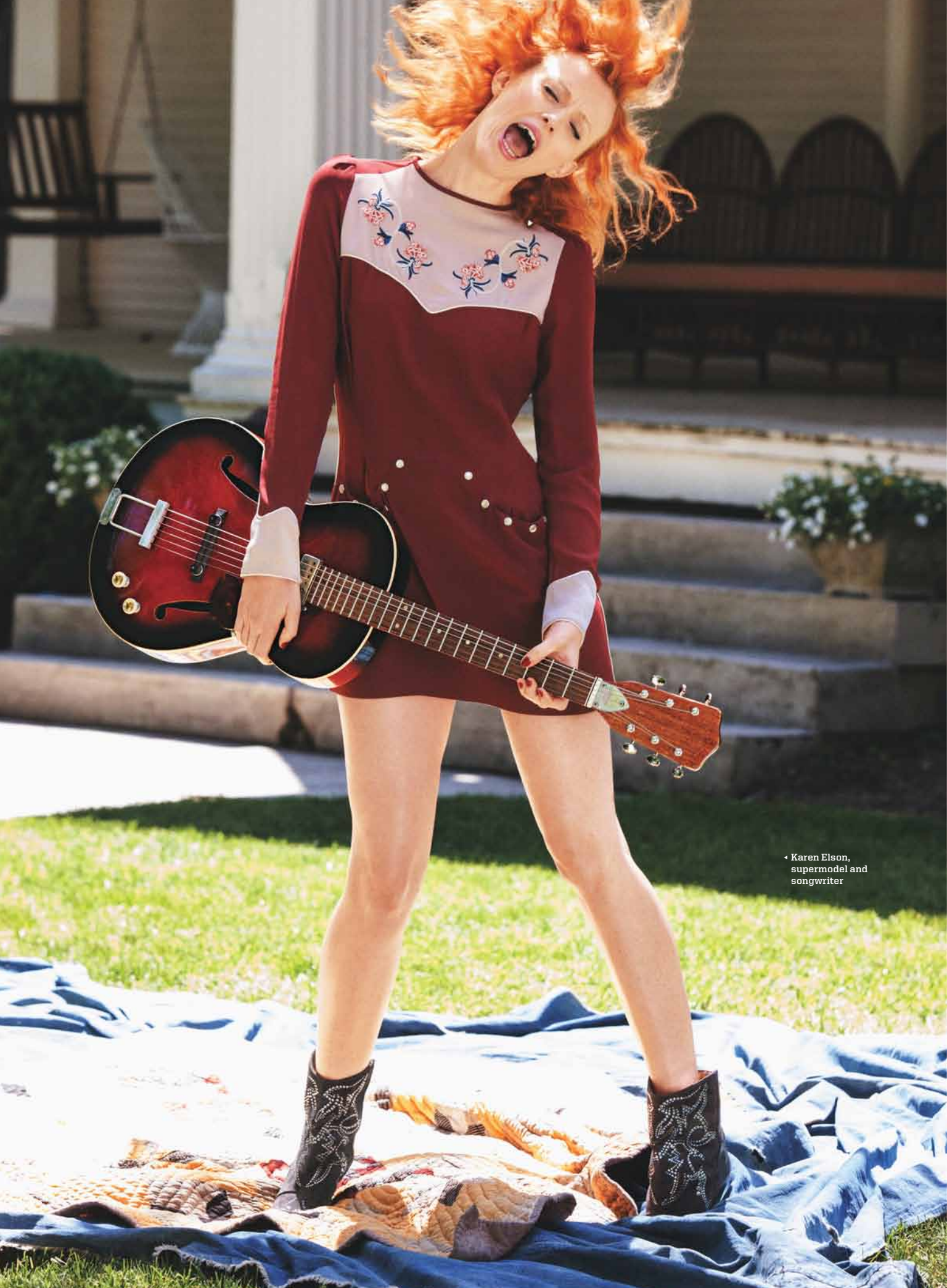
• Karen Elson, supermodel and songwriter