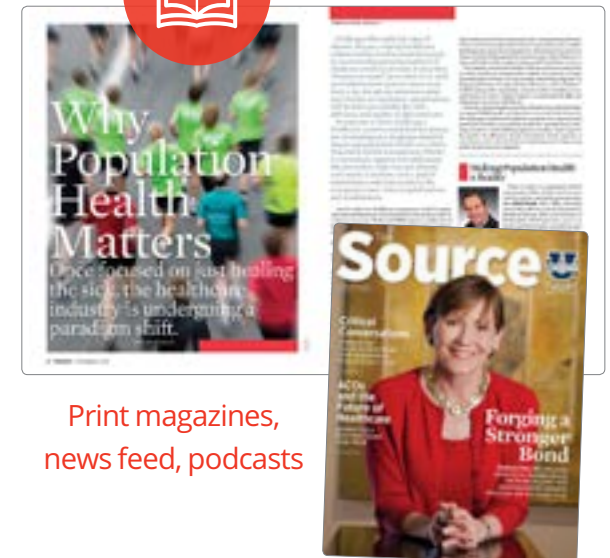
Print magazines, news feed, podcasts