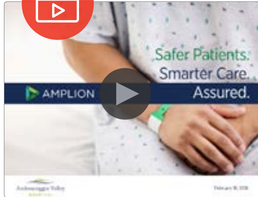
Video user manuals that help customers overcome common glitches