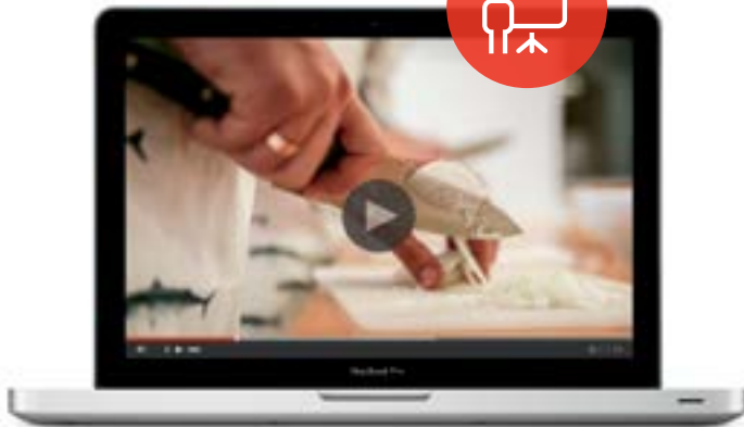
Online and live training, certification