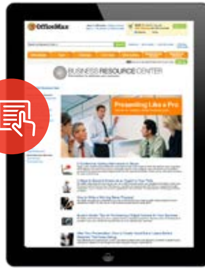
A steady stream of how-tos, case studies, knowledge base or wiki content